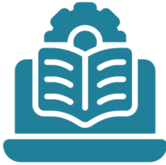
E-Learning Training Modules