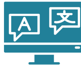
Translation & Localization work